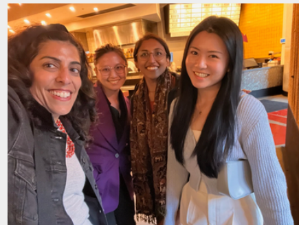
Happy Hour in San Francisco hosted by the Foundation

Would your firm or organization like to host a Fellowship Happy Hour in 2025? Please get in touch!