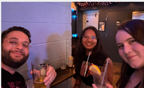
2024 Fellows meeting up in D.C. this summer