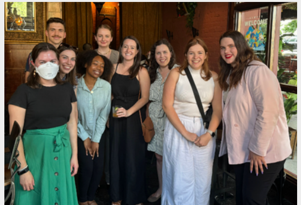
Happy Hour in D.C. hosted by the Foundation

With over 50,000 hours of crucial advocacy work completed, 2024 Fellows join 26 previous year groups of Fellowship Alumni in becoming essential engines of transformation in the realm of public interest law. Congratulations!