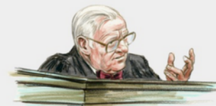
Sketch by Supreme Court Artist: Art Len

https://us06web.zoom.us/joining/register/A06yFVE3SJ4bO37rmWciw